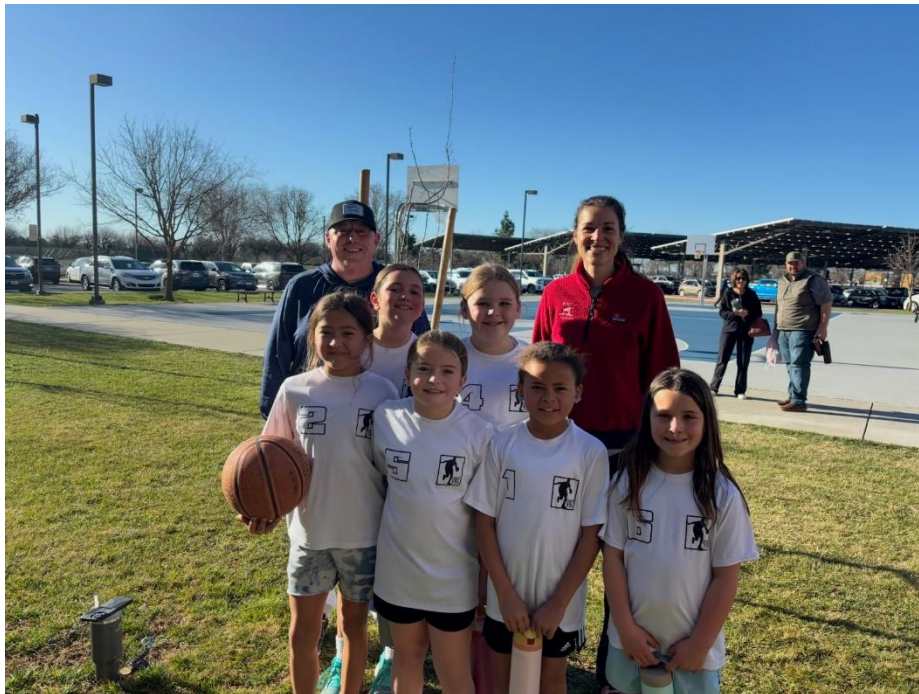
A 10U Girls Basketball team from YBL

Teams competed in eight regular-season games, followed by playoffs for most divisions. The program's success can be attributed to the dedication of 36 head coaches and many assistant coaches who volunteered over 2,000 hours collectively. YBL experienced significant growth this season compared to last year, adding four new teams and 45 additional participants. Financially, the league generated over $40,000 in registration revenue, which reflects a $7,000 increase—a 25% boost from the previous season.