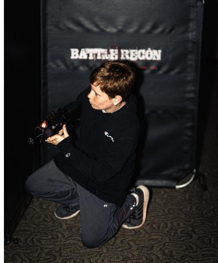
Participant at the January 31 Game On! Event

Game On! On Friday, January 31st, students in grades 6-8 were invited to attend the Game On! event at the Woodland Community & Senior Center. Fifty-three students participated in the 3-hour event, which included Laser Tag, Virtual Reality, interactive games, board games, a movie, and a video game truck. Measure R funded this event.