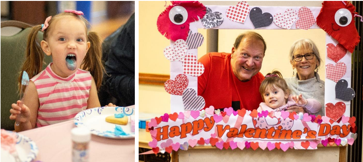
Participants at the February 7 Valentine's Day Cookie Decorating event

Valentine's Day Cookie Decorating: Woodland celebrated Valentine's Day early on February 7th by decorating cookies and making Valentine's. Over 200 people participated in this popular family event. Measure R funded this event.