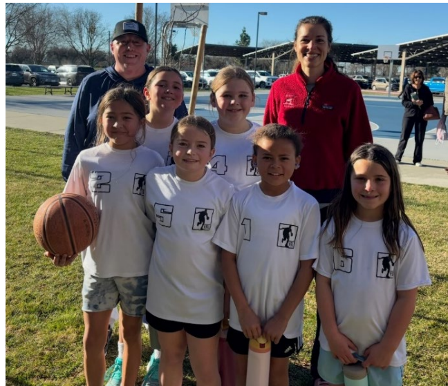
A 10U Girls Basketball team from YBL