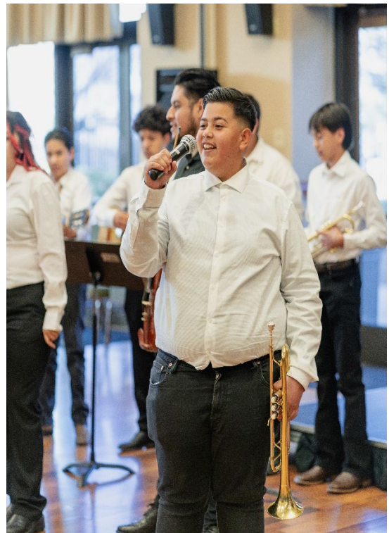
César Chávez Celebration, March 27, 2025