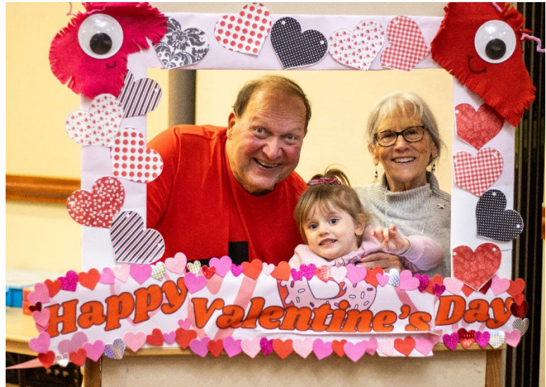
Participants at the February 7 Valentine’s Day Cookie Decorating event