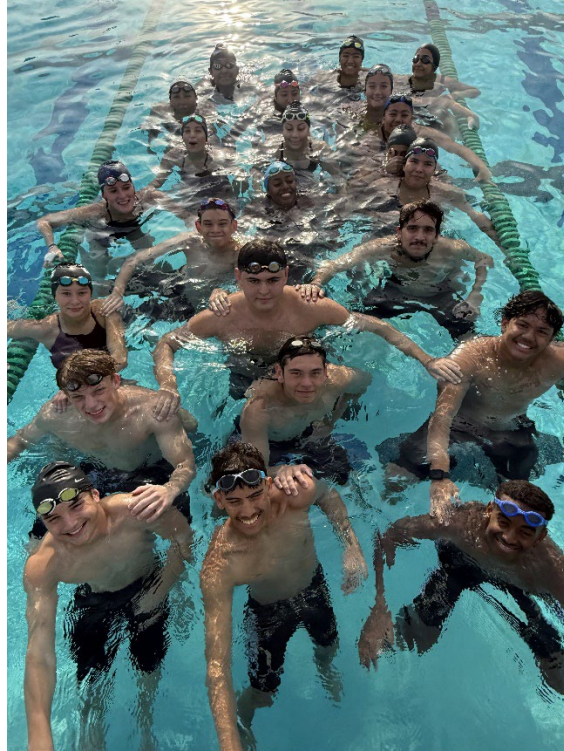
Pioneer High School Swim Team, Spring 2025

During non-programmed hours, the Charles Brooks Community Swim Center is available to reserve for other aquatic activities not affiliated with the City of Woodland. Pool reservation fees account for the facility and safety personnel on-site during the scheduled event. Fees collected during the third quarter included $1,647 for general swim meet reservations and $5,730 from the Woodland Swim Team.