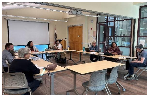
Winters Community Aging Caregivers Townhall

While much work has been done over the years on issues related to aging there has been a renewed focus on the similar and additional needs of persons with disabilities. The commission received public comment, followed by a presentation in February of 2022 from a local mother of a person with an intellectual disability. The comment and presentation highlighted the need to address both the challenges faced by aging caregivers of persons with I/DD and the need for affordable, supportive housing for persons with I/DD. The presentation led to the appointment of an Ad Hoc Committee to receive community input through a series of virtual and in-person meetings throughout Yolo County to hear about the needs of both caregivers, and those living with I/DD. This report summarizes the work of this Ad Hoc Committee and provides recommendations for actions to address these needs.