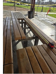
Pioneer Park BEFORE