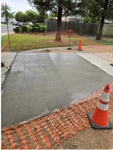
Cline Park's entryway