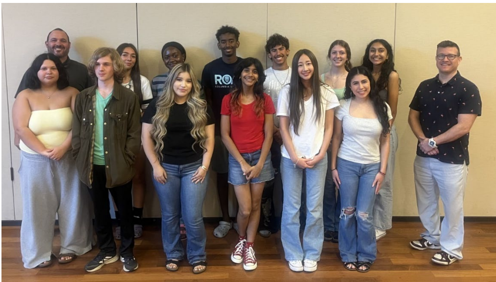
Participants of Recreation Leadership Development 2025-2026

Recreation Leadership Development: The program wrapped up its annual session on April 29. Twenty participants completed the course and were eligible for honorary stipends. The program will be offered again starting in September.