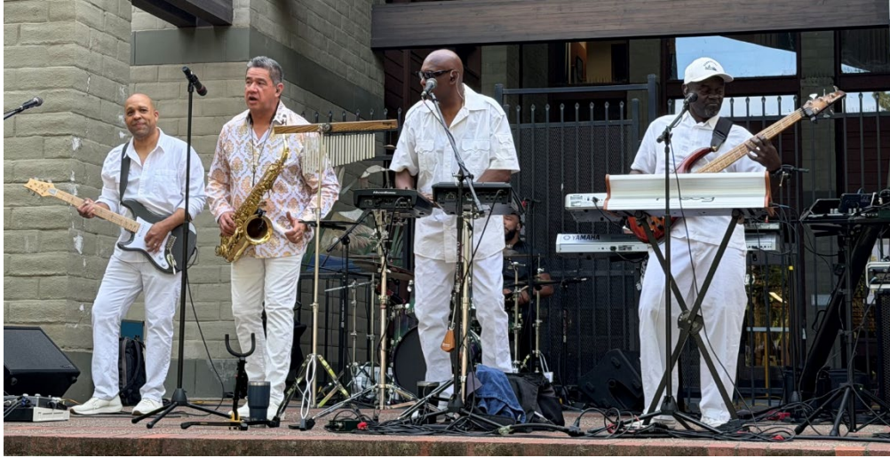
Grooveline performing at Concert on Court, April 17, 2026

Concert on Court: On Friday, April 17, the Community Services Department hosted the second “Concert on Court” event at the old courthouse front lawn. This event featured live music by Grooveline, bounce houses, face painting, free popcorn, and local beer and wine sold as a fundraiser for the Woodland Food Closet. An estimated 450 people attended the show. Staff is planning the next Concert event for October 2026.